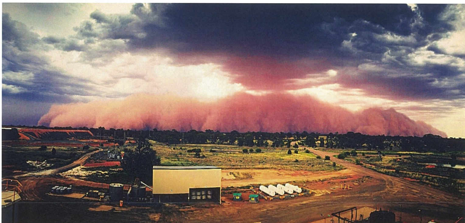
Dust storm approaching TGO from the west near sunset on NYE 2018. Photo by Jason Walters from the top of the processing plant.

Currently located in the old Tomingley School building, the Li'l Tackers Playgroup services farms and villages in the vicinity of Tomingley. Funding of $3590 was granted to support the creation of a 'Baby Safe Zone'. This provides a separate safe space for the littlest kids to play, out of range of the older children.