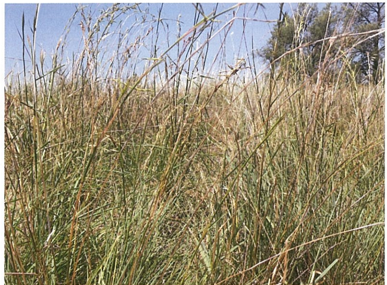
Native grasses such as Barbed Wire Grass ( Cymbopogon refractus ) are regenerating well along the biodiversity offset at Gundong Creek.