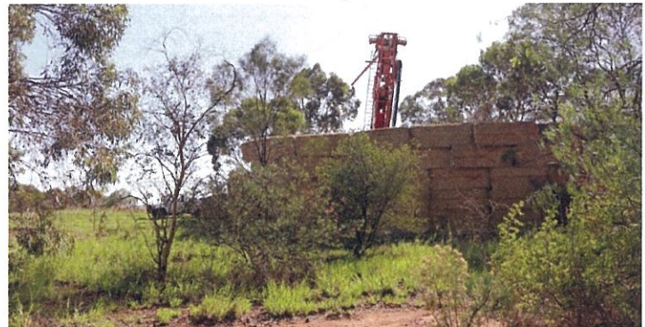
Diamond drilling near Peak Hill in January