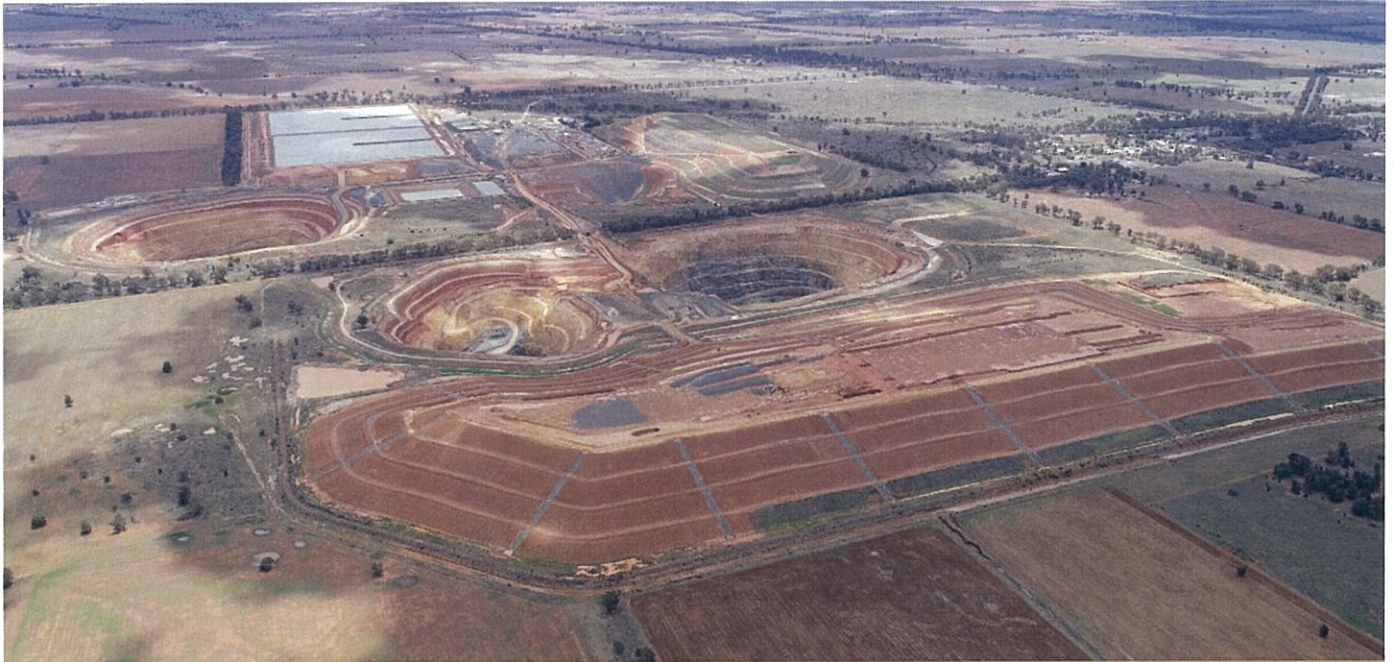
Shaped waste rock emplacements at TGO