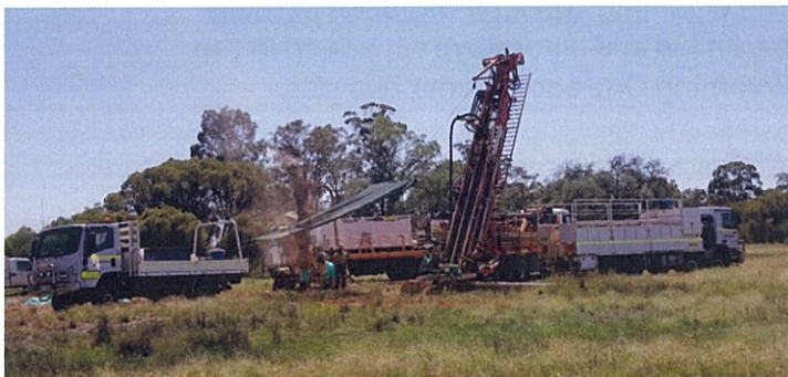
Reverse Circulation drilling at Roswell prospect 24 January 2019

We've also commenced a ten-hole diamond drilling program at Peak Hill to test the sulphide ore below the Proprietary Pit – a site of earlier mining. To minimise noise from the drill rig, which is operating 24/7, we've built a sound wall of hay bales. This drill program is filling in data gaps in the ore resources. The previous drilling was completed in 1998.